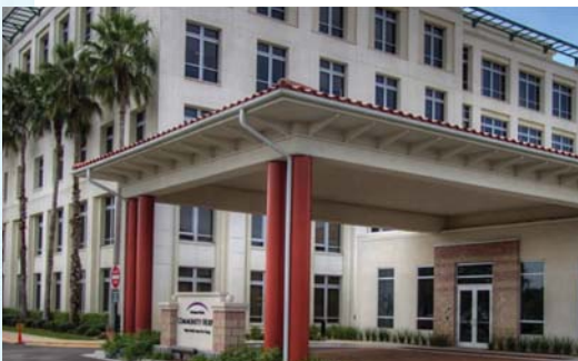
Bailey Family Center for Caring