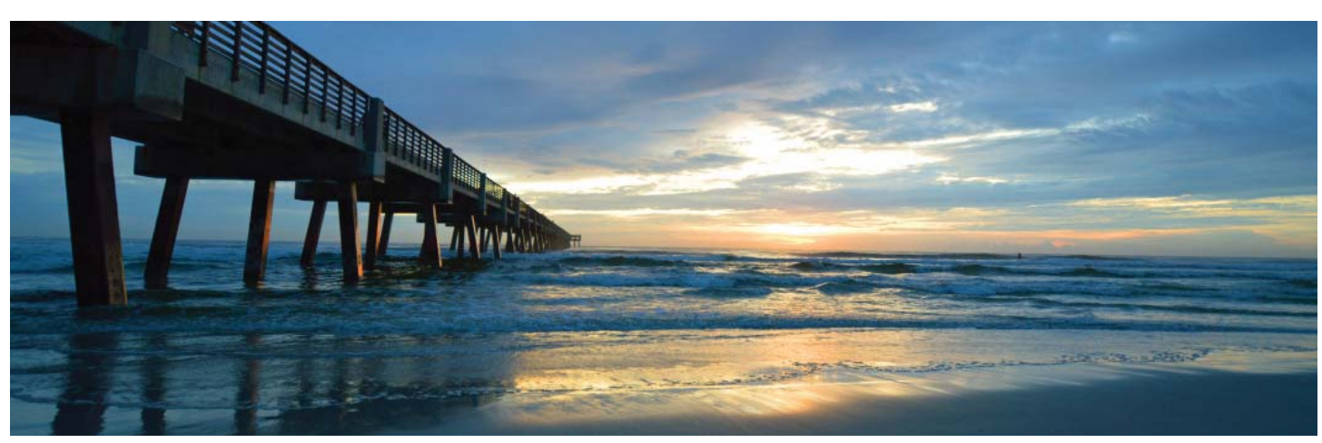
Nearby Jacksonville Beach on the Atlantic Coast

available in six hospitals and in patients' homes