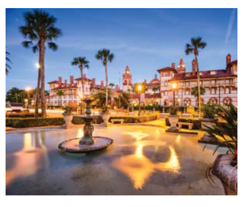
Historic Flagler College in adjacent Saint Augustine, Florida

The Jacksonville Jazz Festival, held downtown, is the second-largest jazz festival in the nation. Jacksonville is home to one major league sports team, the Jacksonville Jaguars of the NFL with home