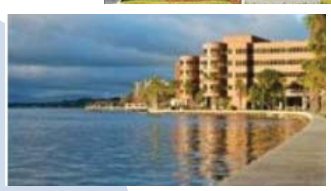
Community Hospice Center for Caring at St. Vincent's Riverside